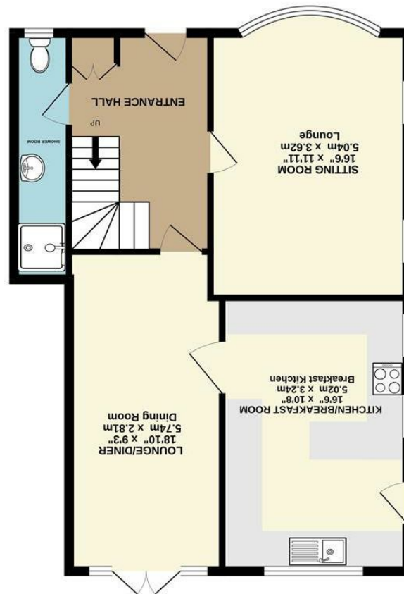
GROUND FLOOR 686 sq.ft. (63.7 sq.m.) approx.